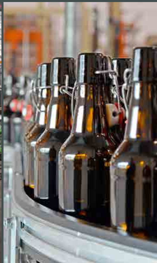
Complete Cold End