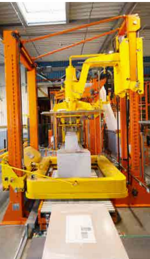
Paper and printing

Experienced teams of project engineers and programmers can develop complete solutions for you, even if your company does not have its own engineering department.