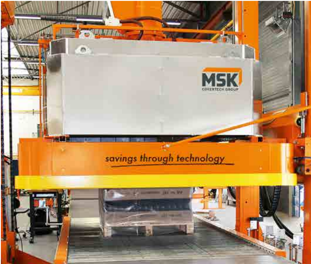
Reduction of CO 2 emissions