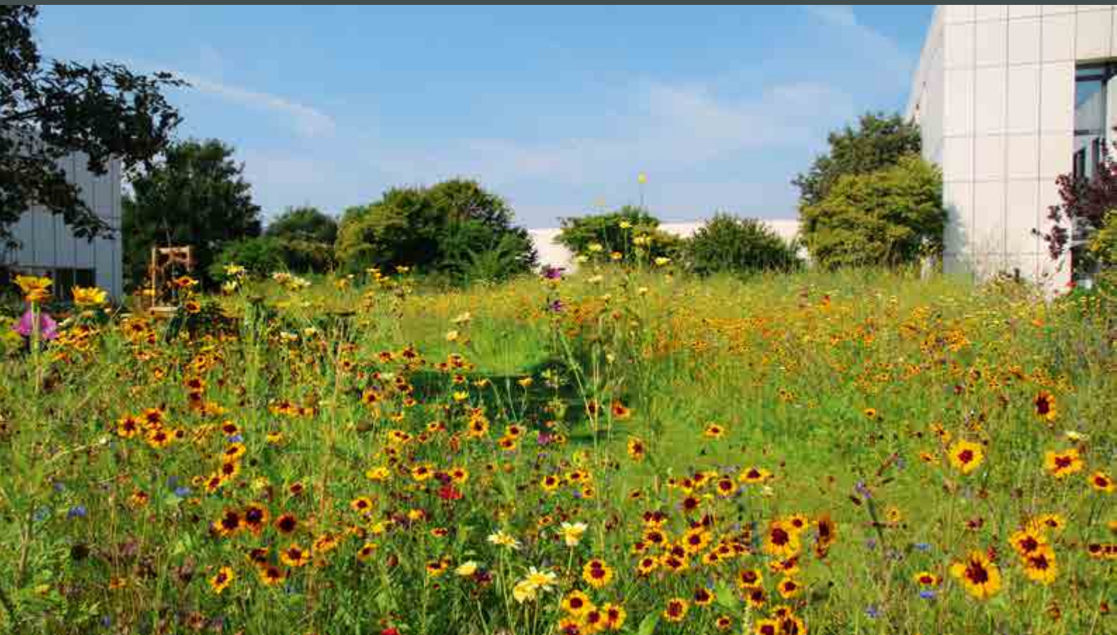
Bee-friendly wildflower meadow