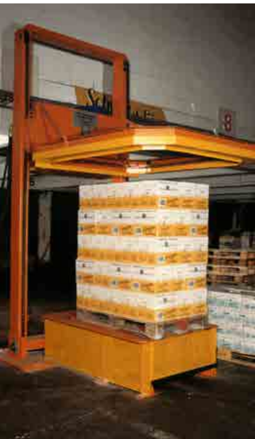
MSK Shrink frame

After its founding in 1975 in Wissel, MSK became a pioneer in packaging with film to secure pallet loads. The MSK Paratech film-hooder developed by MSK in 1979 remains a hallmark of the company until today. The shrink frame technology combined with the patented undershrink procedure were established by MSK on the market in 1981, allowing CO 2 savings in the millions of tons. At the request of an international group, the first fully automatic unwrapping machine, the MSK Defotech, was developed in 1994. As a complete-system supplier, in 2009 MSK offered a complete Cold End for glass factories all from one source for the first time. One of the future focal points are complete solutions for the automation of our customers' entire intralogistics, from goods receipt to the storage of finished goods.