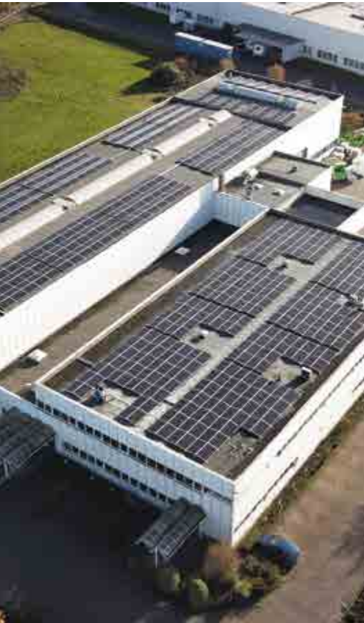
Utilization of solar energy

For our products and company, saving resources is a key focus of all our developments. MSK machines always aim for the lowest energy consumption. With the latest development of the MSK shrink-wrap machine, added energy savings of up to 40% are achieved. In our customer test facility we test our innovations for minimizing the CO 2 footprint. In our buildings and production facilities, energy-saving lighting is used almost exclusively. Photovoltaic systems are in use at some of our sites; further sites will follow soon. The grounds at Kleve were redesigned as a wildflower meadow for bees and other insects.