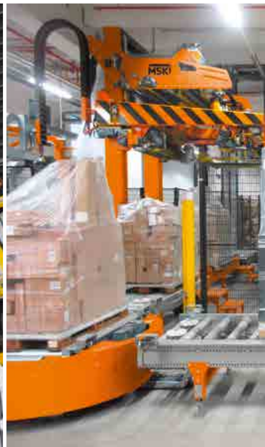
Distribution centers/ logistics